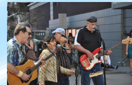
July 20 Isis and the Cold Truth blues, R&B, and New Orleans grooves