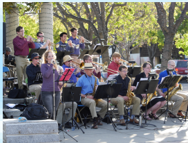
June 1 Top Shelf Big Band big band jazz