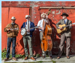
June 29 Windy Hill California bluegrass