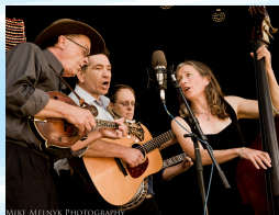
July 27 Bean Creek award-winning, traditional bluegrass

Enjoy the a cappella harmonies of quartets from the Bay Area Showcase Chorus .