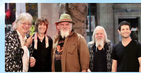
June 15 The Jones Gang high-octane Americana