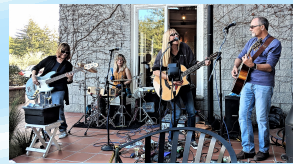
June 8 Blue House acoustic-based rock, country, and R&B