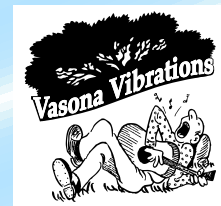
August 3 Acoustic Open Mike 4pm-7pm; get more info at www.VasonaVibrations.org

Food and cash donations to support Second Harvest Food Bank will be accepted at each concert.